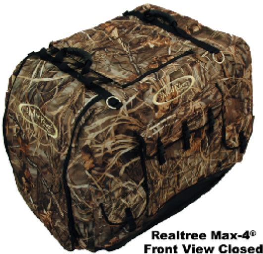
Realtree Max-4® Front View Closed