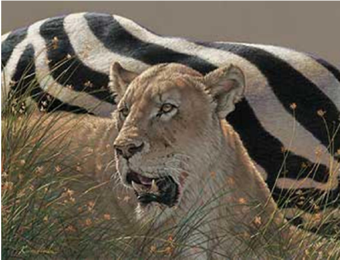
Ngorongoro Morning-Lioness by Lee Kromschroeder

"Situated in the Ngorongoro crater in Africa, a lioness rests for a moment following the kill, her sides heaving as she pants deeply. I chose to use the zebra as the backdrop for the lioness. In this way the picture was infused with the image of Africa."