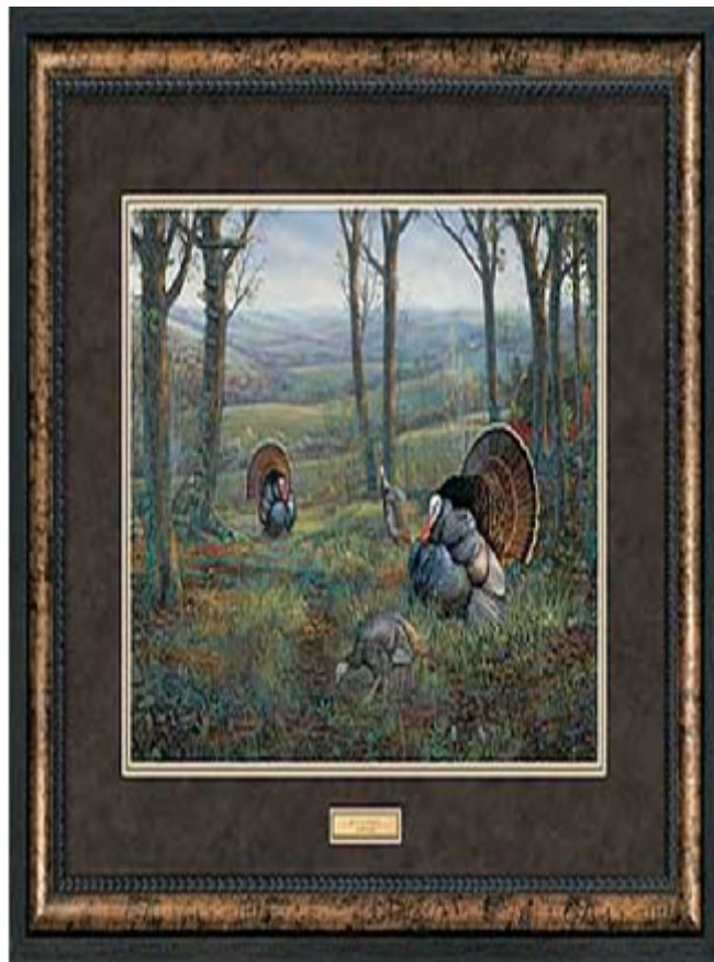
Rut 'n Strut-Turkeys